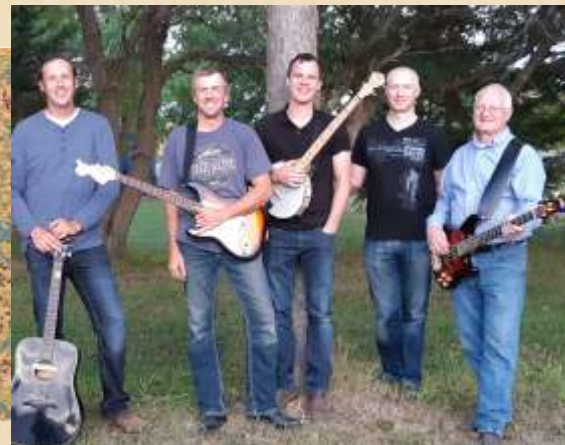
Back 40 Central Saskatchewan