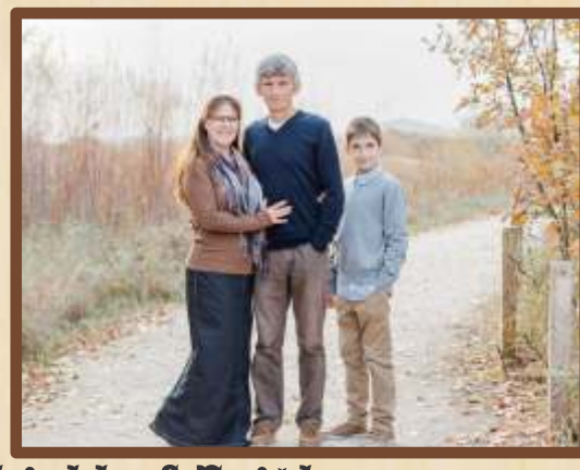
Shield of Faith - Hochfeld, MB