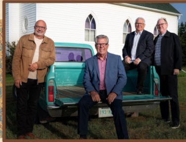
Gospel Echoes Canada West Team