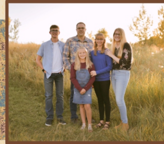
Peters Family Local Group