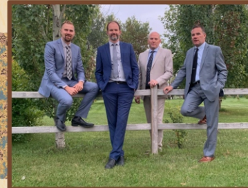
Glorybound Local Group